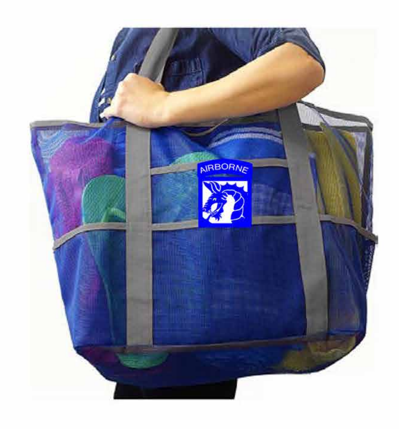
NO LARGER THAN 15" H x 22½" L x 9" W MUST BE MESH OR CLEAR