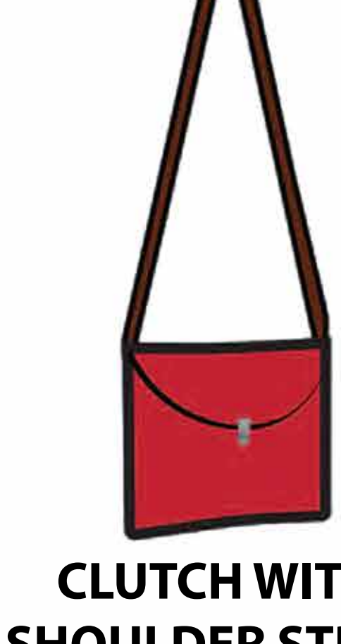
CLUTCH WITH SHOULDER STRAP