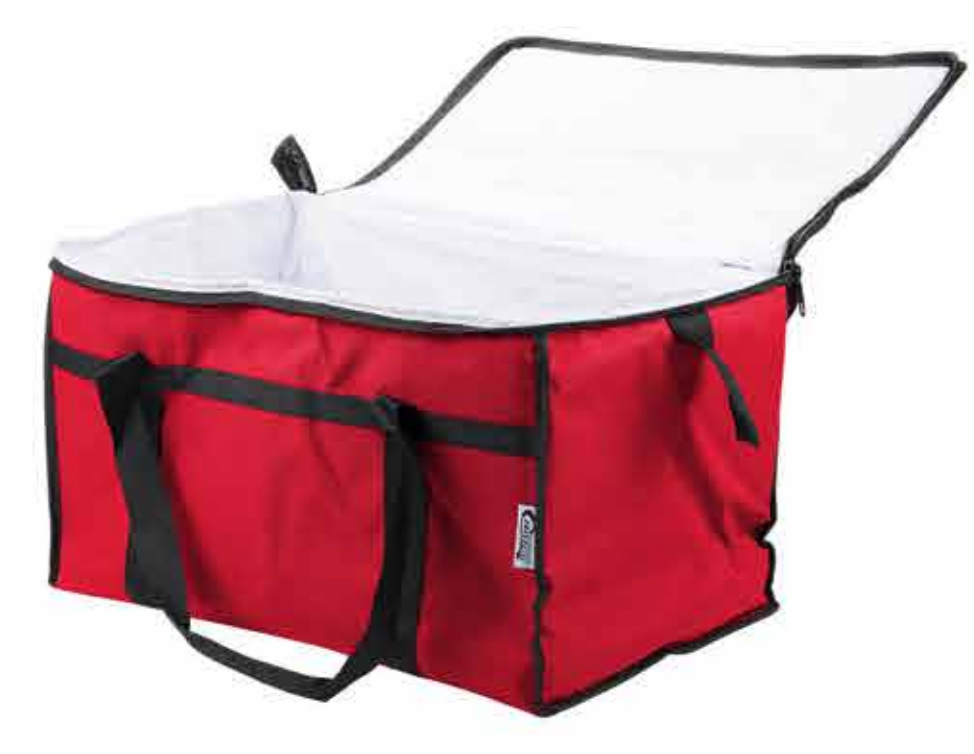
SOFT-SIDED COOLER (CAN BE FILLED WITH APPROVED WATER BOTTLES OR INSIDE EVENT AREA )