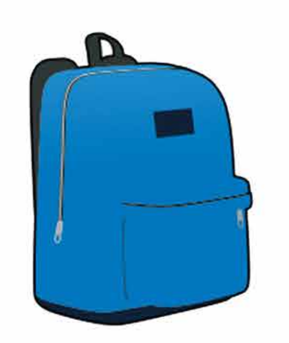
NON-MESH OR NON-CLEAR PACK BACKPACK